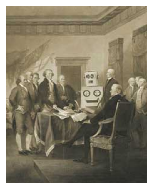
Robot Founding Fathers